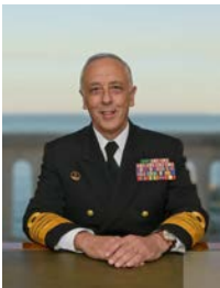
Admiral António Silva Ribeiro