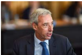
Mr. João Gomes Cravinho

Over 32 years of executive experience in all aspects of logistics operations, strategic planning, program management and information technology while leading large complex organizations ranging in size from 500 to over 180,000 culminating as the Air Force Director of Logistics at the Pentagon. Background includes 4 years of international assignments and logistics consensus building in Europe and Asia/Pacific. An experienced leader, manager, team builder, adaptive problem solver, communicator and coach with a record of success in complex and demanding environments.